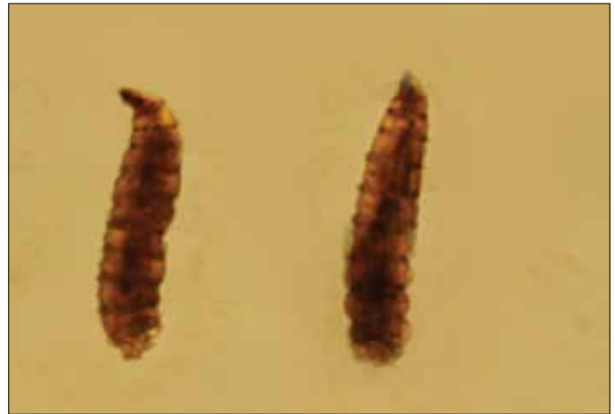
Figure 2. Sarcophaga spp.

Description of larvae was carried out by the method of Jimenez (7), which was slightly modified as follows: the larvae were placed live into Kahle's fluid (6 parts of 35% formalin, 15 parts of 95% ethanol, 2 parts of glacial acetic acid, 30 parts of distilled water) for fixation up to 24 hours, rinsed, and stored in 80% ethanol. For the detection of mouthparts and spiracle characteristics, microscopic examination was done. Prior to the examination, the material was cleared in KOH at room temperature at least for 12 hours. In order to dehydrate, the larvae were transferred to absolute alcohol, and then, the dissection was carried out to obtain mouthparts and posterior spiracles. The flat area of the posterior spiracular disc was