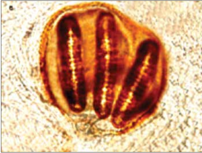
Figure 4. Sarcophaga spp. posterior spiracles of third larval-stage larvae

These characteristics findings provided very useful taxonomic characteristics, which led us to conclude that the larvae belonged to the Sarcophagidae family.