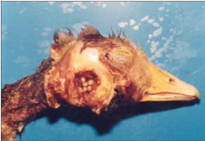
Figure 1. The presence of larvae in the meatus acusticus

myiasis) caused by W. magnifica and Lucilia spp. in geese was described by Farkas et al. (5) in Hungary. Gingival myiasis caused by Diptera (Calliphoridae) was described by Gürsel et al. (6) in Turkey.