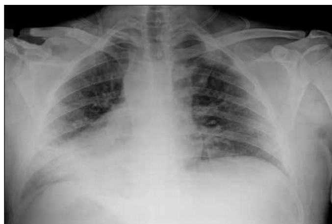
Figure 2. Decline in infiltration in the chest radiograph after 48 hours

P. falciparum malaria can be fatal if not diagnosed and treated promptly. This is especially true in case of non-immune travelers returning from visits to malaria-endemic areas. Severe malaria is associated with the rapid development because anemia-infected, once-infected, and uninfected erythrocytes are hemolytic and removed from the circulation by the spleen (2). Replacement of blood and fluids may lead to rapid reductions in lactate levels, resolution of metabolic acidosis, improvement in renal function, and clinical improvement in critically ill patients (3).