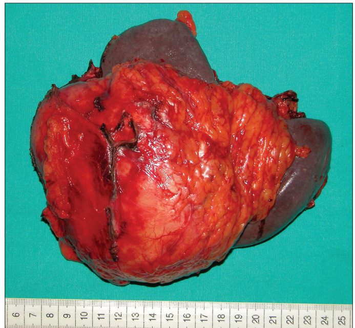
Figure 2. Hydatid cyst in posterior part of the spleen