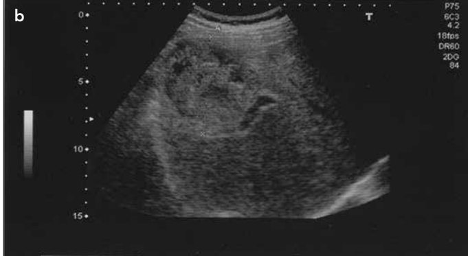
Figure 2. a, b. Hydatid cyst of 120 mm in diameter before treatment (a), Appearance 7 months after treatment (b). The cystic lesion reduced in size and became solid