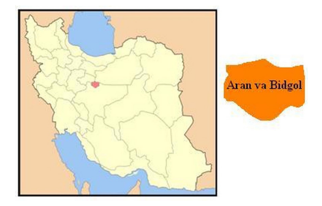
Figure 1. Geographical location of Aran va Bidgol County in Map of Iran, region of study

during autumn were higher compared with those during summer. The number of cases was higher in the months of October, November and December (20%, 24% and 13%, respectively). The lowest frequency of CL cases was seen in spring (2.4%) (Table 1). The most cases were observed in 2012 (26.2%) and the lowest (5%) was in 2015. The highest annual incidence of CL was