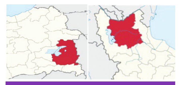
Figure 1. Geographic regions of Turkey (left) and Iran (right) where hydatid cyst samples were collected (red regions)

Moreover, two samples had not any homologous to the related sequences in the GenBank, and one sample had similarity to the Echinococcus granulosus from Armenia (KX020349). Therefore, these three samples from Turkey were considered as genotypes G1/G3 strain. All isolates of sheep and cattle from both countries clustered in one group within 5 different haplotypes.