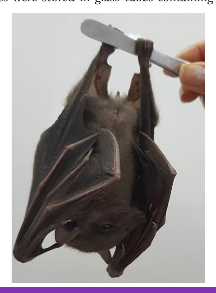
Figure 1. Egyptian fruit bat or Egyptian rousette Rousettus aegyptiacus

The Egyptian rousette, which was found to be grounded for an unknown reason, was brought to a private veterinary clinic in Antalya, Muratpaşa district for general condition control (Figure 1). Determination of the bat was made by Devrim Yetkin (Akdeniz University Faculty of Science, Department of Biology, Antalya, Turkey). Bat flies were sampled during examination of the bat. Fly samples were stored in glass tubes containing 70% alcohol