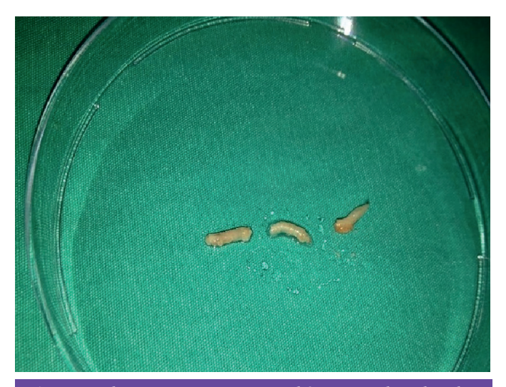
Figure 2. Three maggots are removed from periodontal pocket of palatal region of maxillary incisors

with an open wound, mouth-breathers and drunkards (11). Myiasis might be subdivided into primary and secondary. Primary myiasis arises from biophagous larvae) and it is also known as obligatory myiasis. Secondary myiasis arises from the necrobiophagous larvae and it is also known facultative myiasis (12).